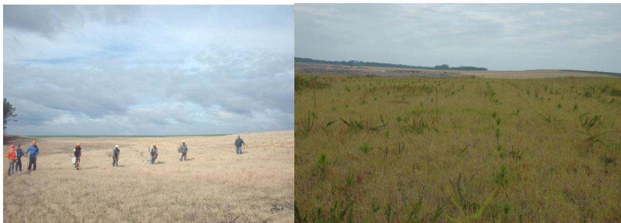
Figure 2. Loblolly pine seedlings planted on a 2 x 3 m foot spacing ( 1982 \text{ trees ha}^{-1} ) into winter dormant bermudagrass (left) and typical success 1 year after establishment (right) .

survival ranged from 60 to 80% and tree height growth was 0.7 to 1.5 m per year 3 to 4 years after planting (Lang and Hawkey, 2008). The heavy bermudagrass ground cover in years 1 to 3 diminished due to a lack of additional fertilizer and was replaced by native successional species. Unlike commercial pine plantings, hardwood species have been virtually absent during the first round of reclamation. Hardwoods sparsely volunteer within a normal southeastern USA successional pattern but they are not present until the pines are 1 to 2 meters tall and appear to have little initial potential to compete. Recruitment of grass and forb species from surrounding areas was common as bermudagrass declined.