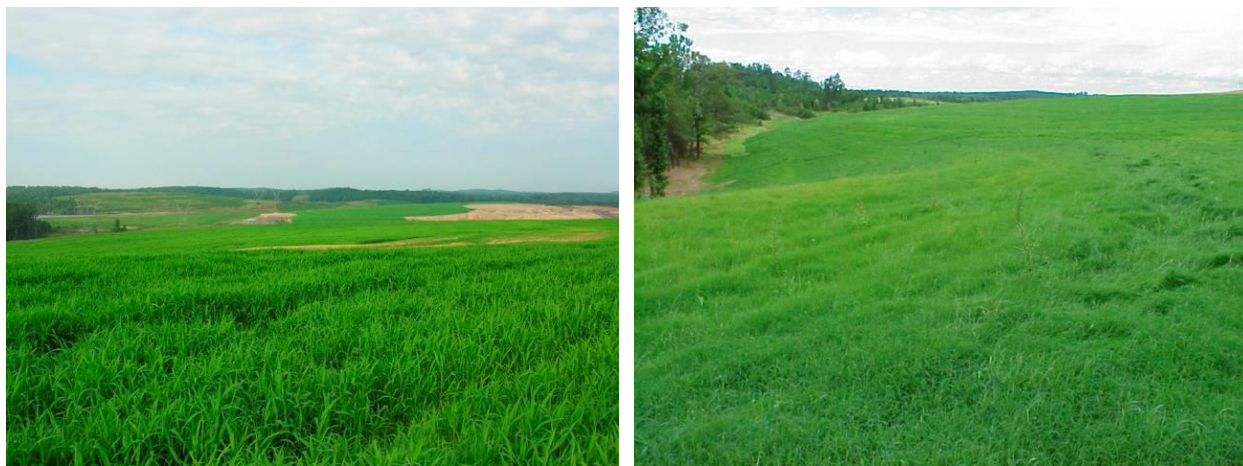
Figure1. Thirty day planted stand of browntop millet (right) is replaced by bermudagrass (left).

bermudagrass ( Cydonon dactylon ) at 33 kg ha -1 , planted simultaneously using a Brillion seeder (Fig. 1). These higher than normal seeding rates are essential for achieving quick and complete ground cover within 30 to 60 days. Reclaimed areas respread in late summer or early fall are planted with winter wheat ( Triticum aestivum ) into which bermudagrass and browntop millet are planted the following spring in order to establish a winter cover crop to reduce winter soil erosion as much as possible. Competition from bermudagrass is kept minimal due to lack of additional fertilizer and by adequate and copious amounts of rainfall that normally exceeds 1500 mm annually.