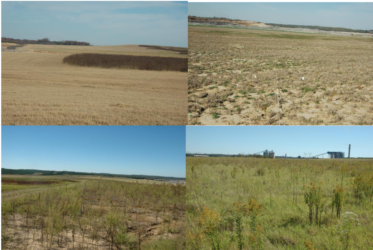
Figure 3. Top Left: Bermudagrass established in 2007 (Area 2008-5/ROX5); Top Right: Poor establishment of bermudagrass in 2006 (Area 2007-1/ROX1); Bottom left: Poor establishment of bermudagrass in 2006 (Area 2007-2/ROX2); Bottom Right: Bermudagrass established 2006 (Area 2007-4/PFL4).

Loblolly pines were planted as bare root 1 year old seedlings on a 2x3 m spacing (1982 trees ha -1 ) in January, 2007. During the spring of 2007 there was an extended spring drought from March until July. Due to poor loblolly survival during the drought of 2007 each area was replanted with up to 1236 additional trees per hectare during January of 2008.