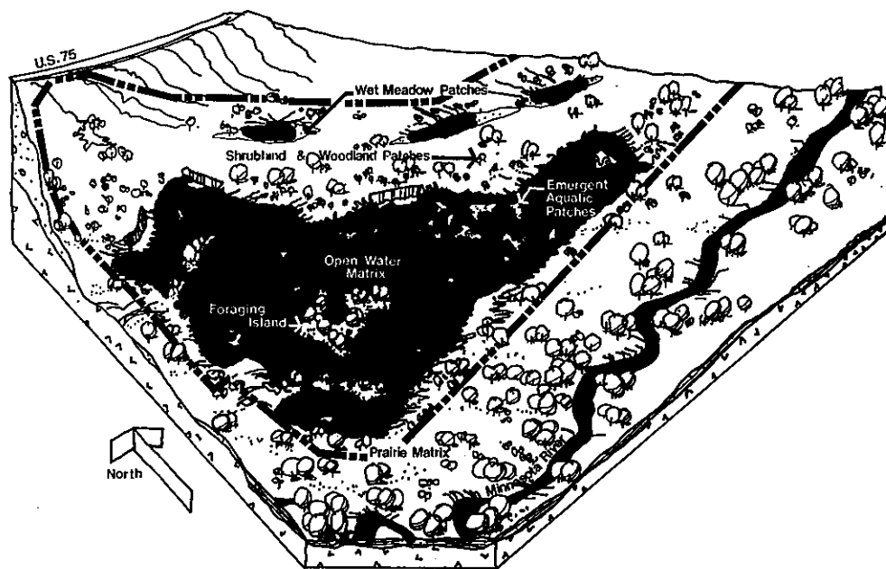
Figure 3. This drawing illustrates landscape patterns of a proposed post-mining land-use plan.